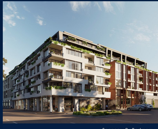
Spencer: 2 - Bedroom