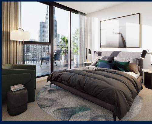
Roden: 3 - Bedroom