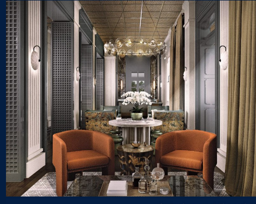
2 - Bedroom + 1 Elegant