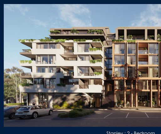
Stanley: 2 - Bedroom